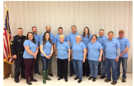
2018 Citizens Academy Graduating Class

This class is a must for those people who live or work in or near the West Hennepin Public Safety Department's jurisdiction. The West Hennepin Public Safety Department is currently establishing a list of participants who would be interested in the next class. The recommended attendee age is 18 years and older. Please contact the West Hennepin Public Safety Department at (763) 479-0500 between the hours 9:00 a.m. - 4:00 p.m., if you are interested in attending the Citizens Police Academy.